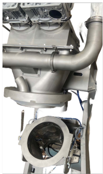
Drop down bag clamp for easy cleaning