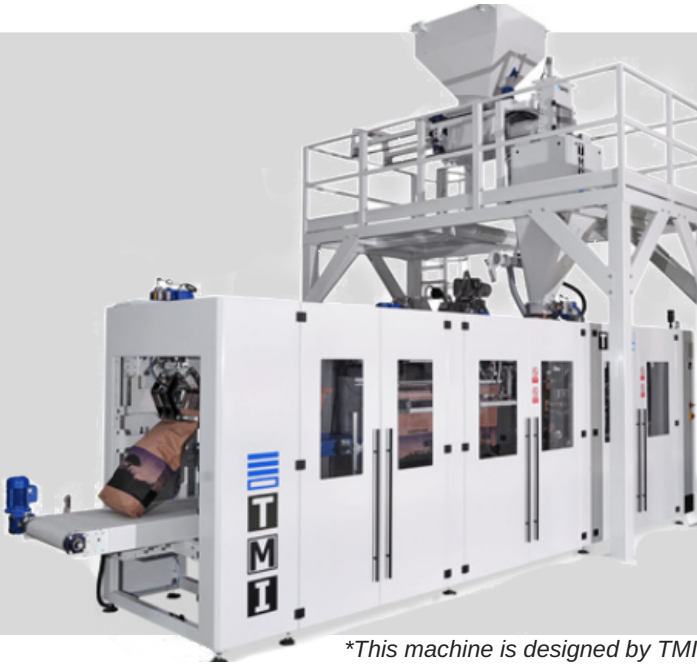
*This machine is designed by TMI

AUTOMATIC BAGGING MACHINE FOR OPEN MOUTH BAGS